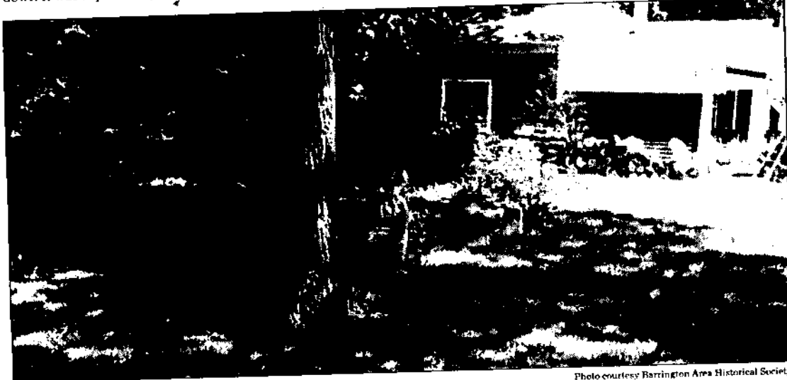
Haeger School was built in 1857 and the school grounds included a cemetery. Today the one-room school house is a private home complete with cemetery in the yard.